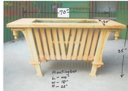
Victorian style: $225

Circle the style photo you are purchasing and mail a copy of this completed order form with your payment by Oct 1 to: Chester Townscape at PO Box 561, Chester, VT 05143.